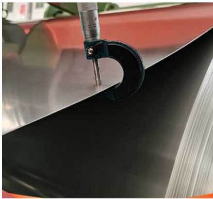
■ PRODUCT INSPECTION