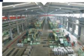
STAINLESS STEEL PRODUCTS