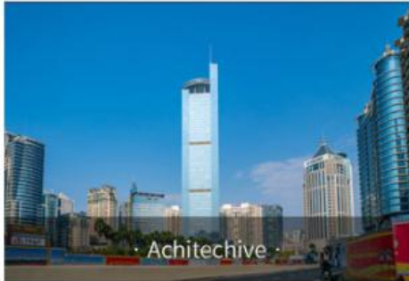
· Achitechive ·