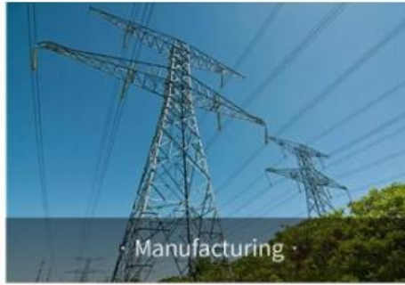
· Manufacturing ·