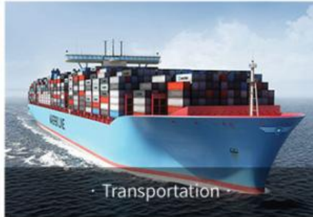
· Transportation ·