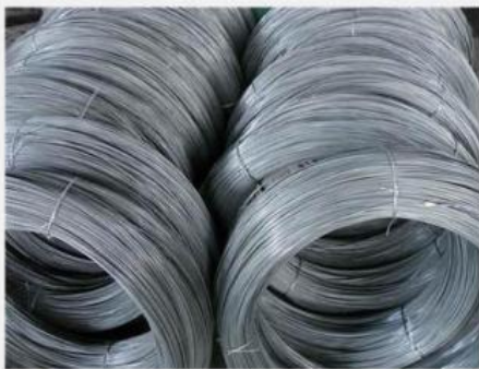
Stainless steel cold drawn wire is widely used in construction, industry, chemical products, etc.