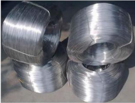
Stainless steel spring wires are widely used in electron, chemical and medical equipment, etc.