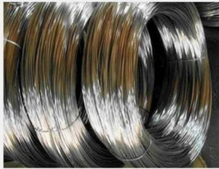
Stainless steel bright wire is applied in petroleum, electronics, machinery and construction, etc.