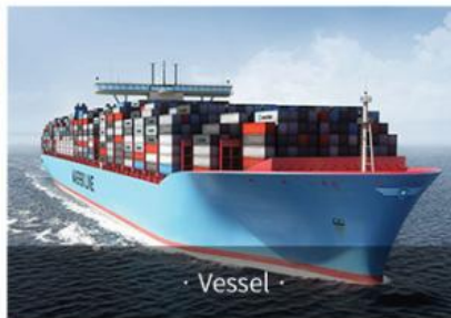
· Vessel ·