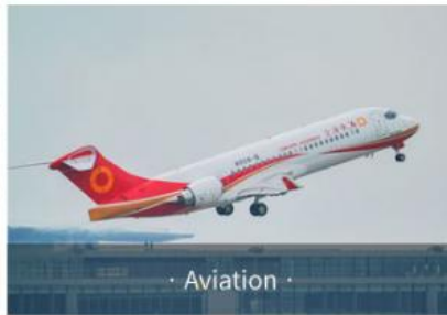
· Aviation ·