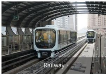
· Railway ·