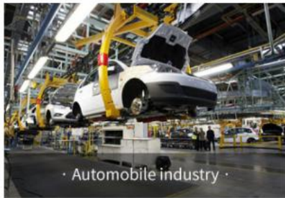
· Automobile industry ·